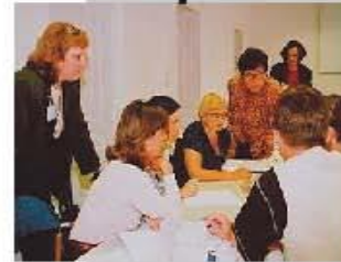
5. "This training would be more parent-friendly if..."