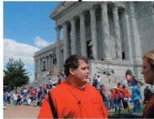
2. Rally against health care cuts at state capitol