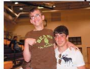
6. "My personal experience helps the UCEDD meet the needs of the community."