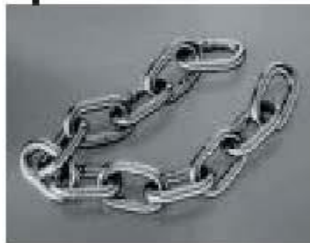
1. Participate in civil disobedience