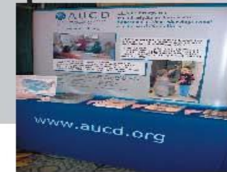
7. EDUCATE the community and legislators about the UCEDD's projects