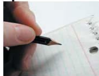
3. ADVOCATE for the needs of PWD's with your legislator