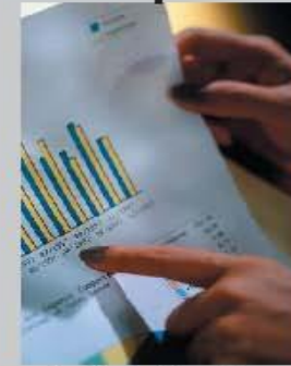
8. Help Develop Five Year Plan