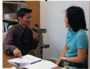
4. "I insist you include this in my person centered plan."